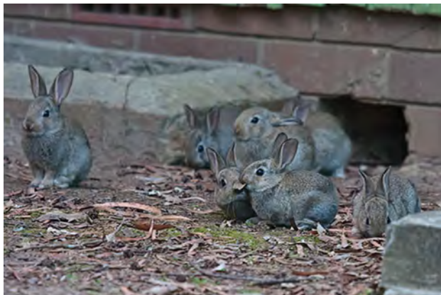
Figure 1 Wild rabbits in Australia. The rabbit population grew so quickly in Australia that the event became known as the “rabbit plague.”