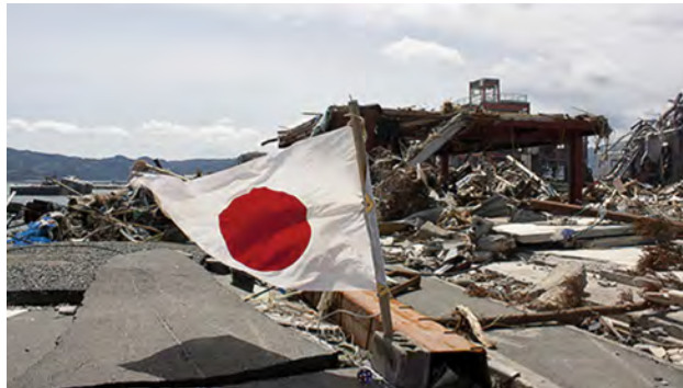
Figure 1 Devastation of March 11, 2011 earthquake in Honshu, Japan.

In 2010, a major earthquake struck Haiti, destroying or damaging over 285,000 homes [19] . One year later, another, stronger earthquake devastated Honshu, Japan, destroying or damaging over 332,000 buildings, [20] like those shown in Figure 1 . Even though both caused substantial damage, the earthquake in 2011 was 100 times stronger than the earthquake in Haiti. How do we know? The magnitudes of earthquakes are measured on a scale known as the Richter Scale. The Haitian earthquake registered a 7.0 on the Richter Scale [21] whereas the Japanese earthquake registered a 9.0. [22]